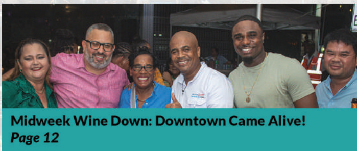
Midweek Wine Down: Downtown Came Alive! Page 12