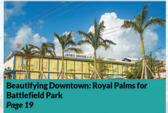
Beautifying Downtown: Royal Palms for Battlefield Park Page 19