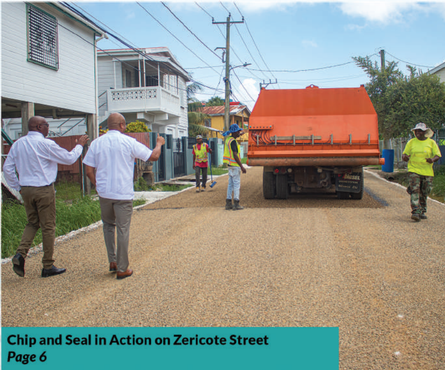
Chip and Seal in Action on Zericote Street Page 6