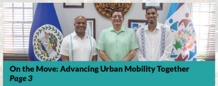
On the Move: Advancing Urban Mobility Together Page 3