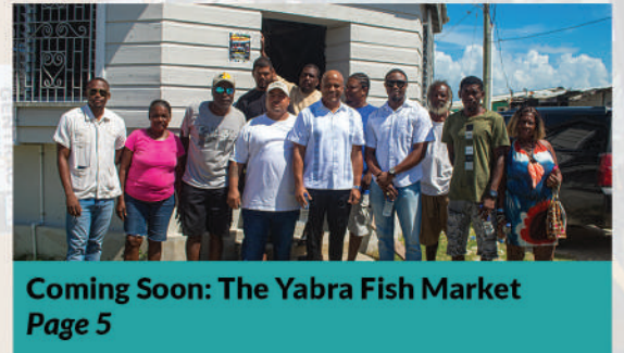
Coming Soon: The Yabra Fish Market Page 5