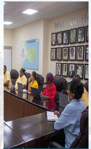
Hurricane Season Enhancing Preparedness Page 3