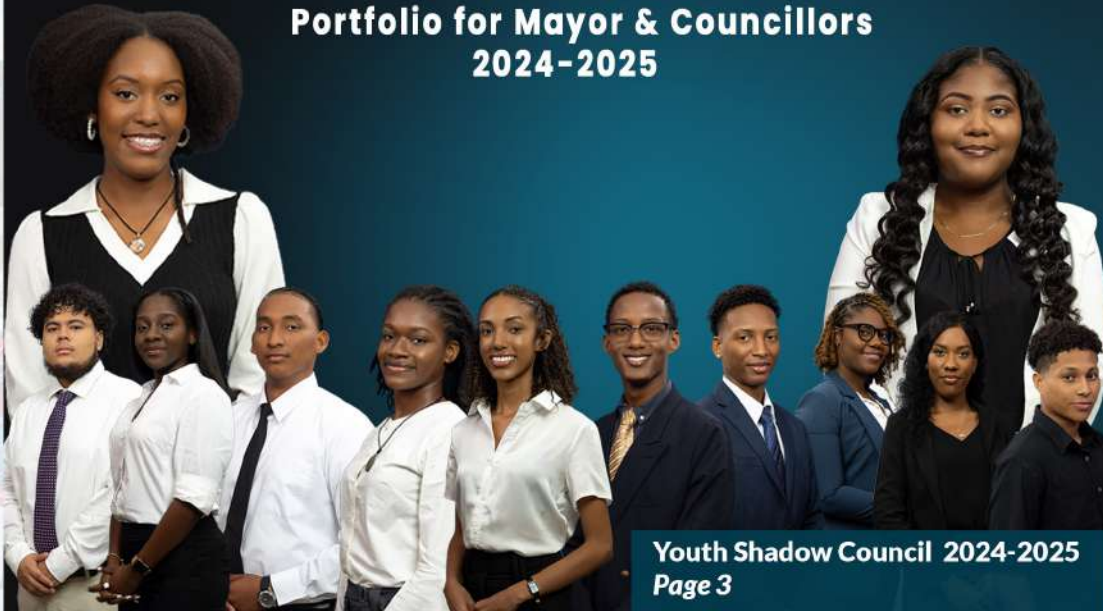
Youth Shadow Council 2024-2025 Page 3

Portfolio for Mayor & Councillors 2024-2025