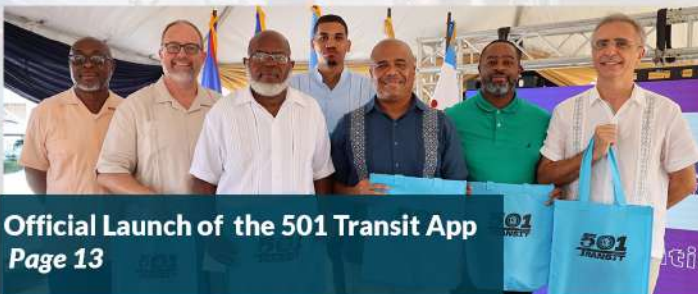
Official Launch of the 501 Transit App Page 13