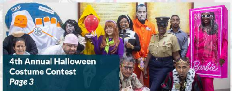
4th Annual Halloween Costume Contest Page 3